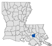
St. James Parish